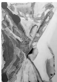
kill himself Epstein didn't, 2019 (akrylmaling, majs, lim, blyant, olie på pvc-lærred).

kill himself Epstein didn't, 2019, 2019 (akrylmaling, majs, lim, blyant, olie på pvc lærred).